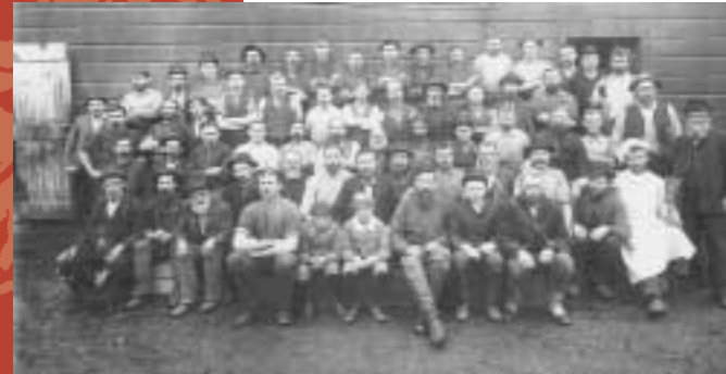
Workers at Eberhard's Santa Clara Tannery