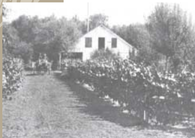
Cook's Grove, built in 1853