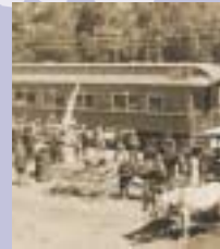
Santa Clara Depot circa 1890