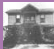
Fair View Sanitarium, Los Gatos