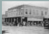
Widney Store at Franklin & Main circa 1869