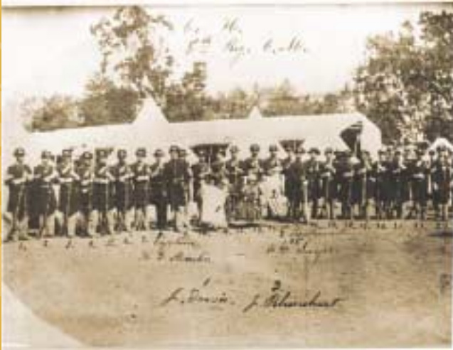
Many California men participated in the Civil War