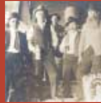
Santa Clara Brewery workers