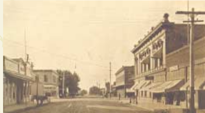
Post Office (far right) on Main Street, Santa Clara