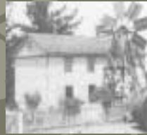
Kenyon home and windmill