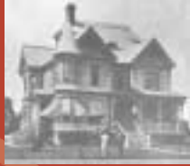
The Morse home