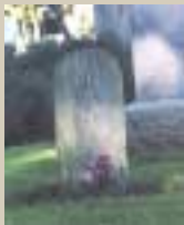
Wooden grave marker

The only two wooden headstones still in existence in Mission City Memorial Park date back to the 1906 earthquake. The most severe earthquake damage in the Valley was experienced at the Agnews Asylum for the Insane in Santa Clara where it was reported 253 patients and staff were killed when several buildings collapsed. The scene was described as "chaotic" and "bedlam" as terrified and injured patients shrieked for help. More than 100 surviving patients were tied to trees to restrain them because there was no safe building nearby where they could be confined. Not far away, little damage was done to Santa Clara College and no one was injured.