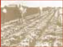
Morse's seed farm