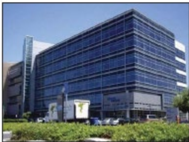
Accessibility to transit and alternative modes of transportation, as well as improved transit facilities will support higher intensity development along the City’s key corridors and near transit stations.